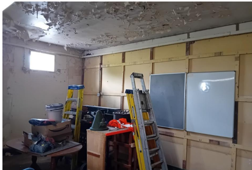
The main room in the Ops Block was in very poor condition but work has started on cleaning and 'making good'. The Bloodhound team has already put up two 'work boards'.

You cannot visit the Ops Block unless escorted – but well worth asking for an escort so you can visit this area.