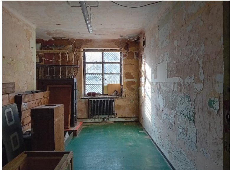
Canberra and Hunter parts. Right: cleaning down the workshop room.