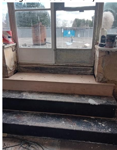
The wooden stairs to the roof were in a very poor state and had to be removed. Our carpenter has managed to salvage quite a bit of the original and built new where nothing could be saved.