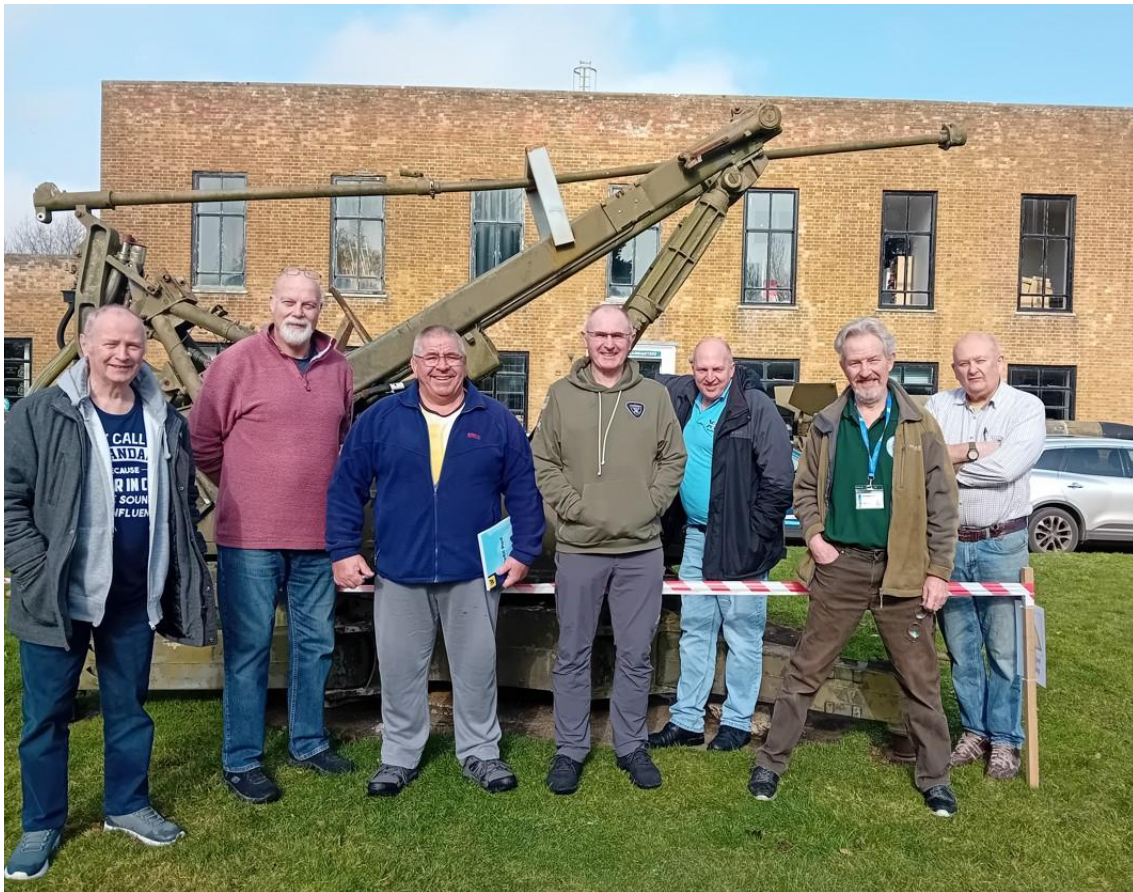
Part of the Bloodhound Engineering Team. Below: A spot of washing down to remove years of grime.