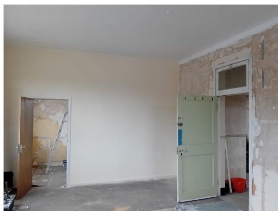
Left: August 2023. Right: February 2026 (and moved on again since this view).