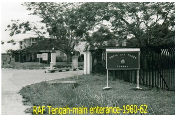
RAF Tengah-main entrance-1960-62

You never know who or what will come through the door at Veterans Central. In March we received a donation of a wide selection of original photographs concentrating on the RAF in the Far East. These are just a few of those for RAF Tengah (Singapore) and 45 and 60 Sqn who were stationed there in the 1960s. A reminder that we have our East of Suez History Day on Sunday 16th of August. The month has also seen several other additions to our archive and displays.