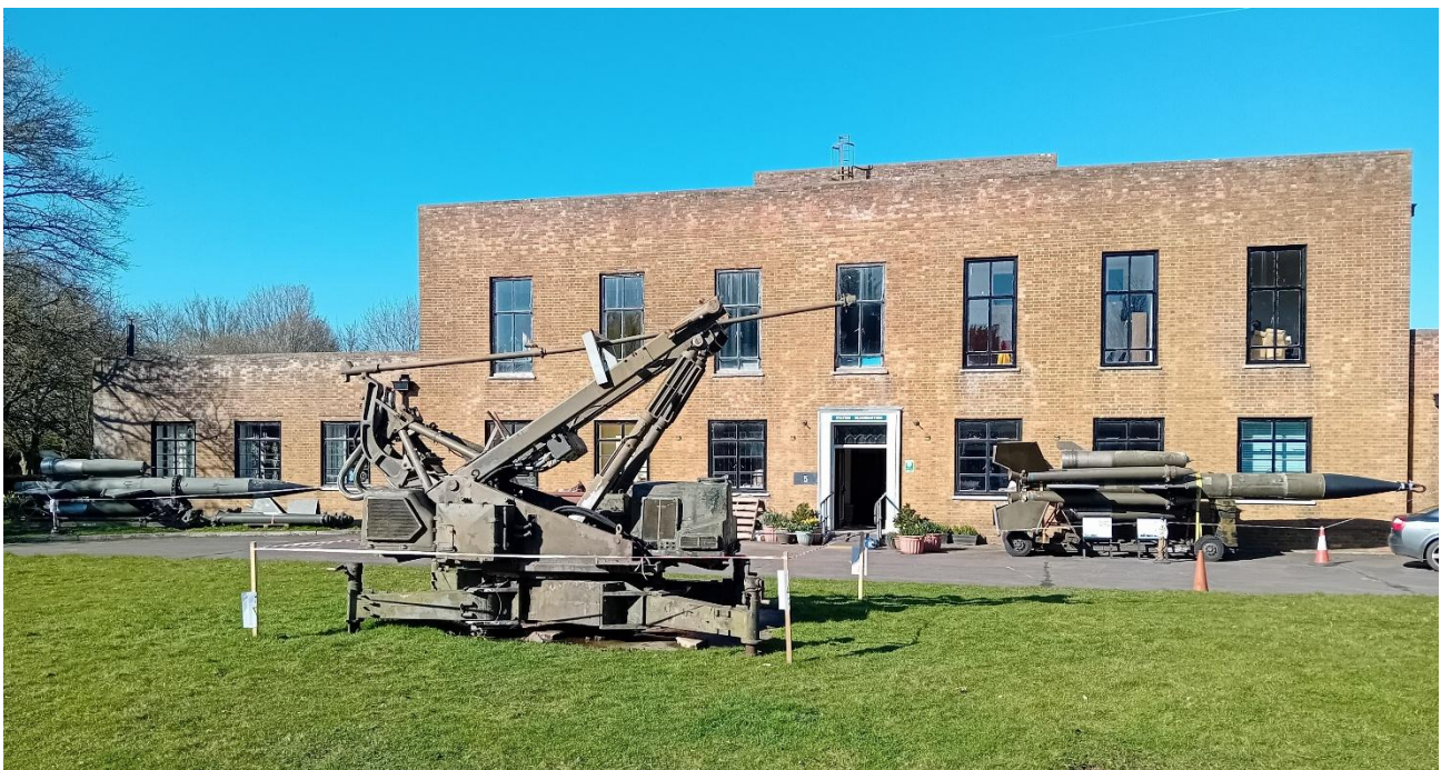
Bloodhound Missiles returns to SHQ!